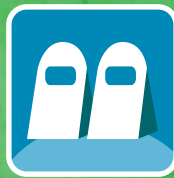
New refuse Containers

maintaining our village clean is a job for everybody