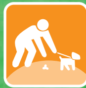
Collection of dog mess